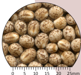
PBA Barlock ®

Source: Pulse Breeding Australia Data is an average of 9 sites across 3 years (2009 - 2011)