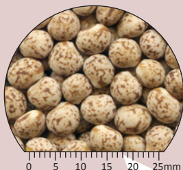
PBA Gunyidi ®