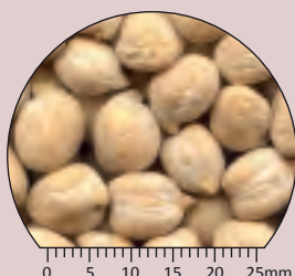
PBA Monarch ®

Data is average of 9 sites, southern (7 sites) and northern (2 sites) Australia across 4 years (2009-12)