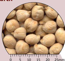
Genesis ™ 090