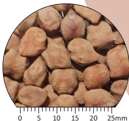
PBA Drummond ®

Milling Performance % = Split Yield %, average of 2 CQ sites x 2 years (2013 and 2016)