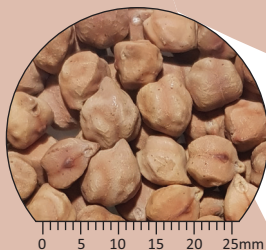
PBA Pistol ®