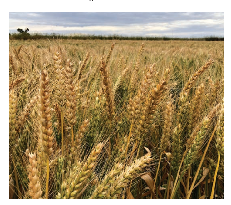
Reilly was bred by BASF and evaluated as the line number BH120020S-11. Reilly is protected by Plant Breeder's Rights (PBR) and an EPR of $3.55 (+ GST) per tonne applies to grain production.