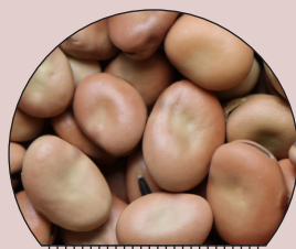
PBA Amberley ®

Source: NVT. Data derived from 25 rainfed trials in SA, Vic and th NSW in 2016–2018