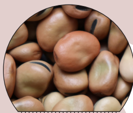
PBA Samira ®