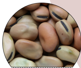
PBA Zahra ®